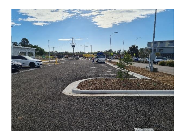
Figure 4: Completed car park and landscaping