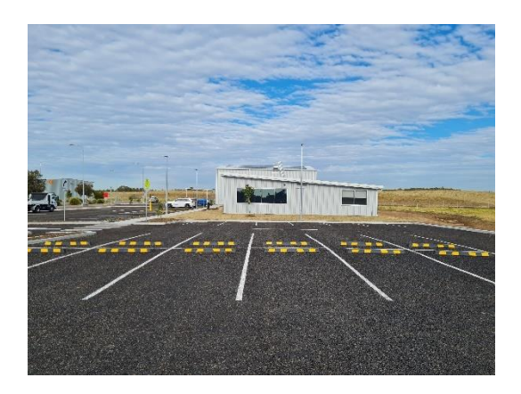
Figure 6: Completed car park depot