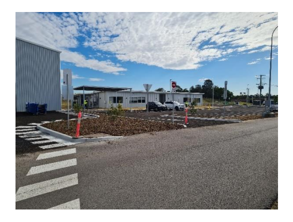
Figure 1: Completed Depot with landscaping