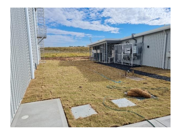
Figure 3: Laid turf