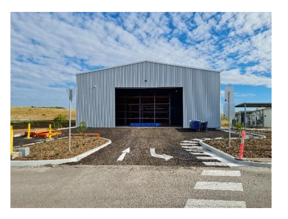
Figure 2: Completed shed