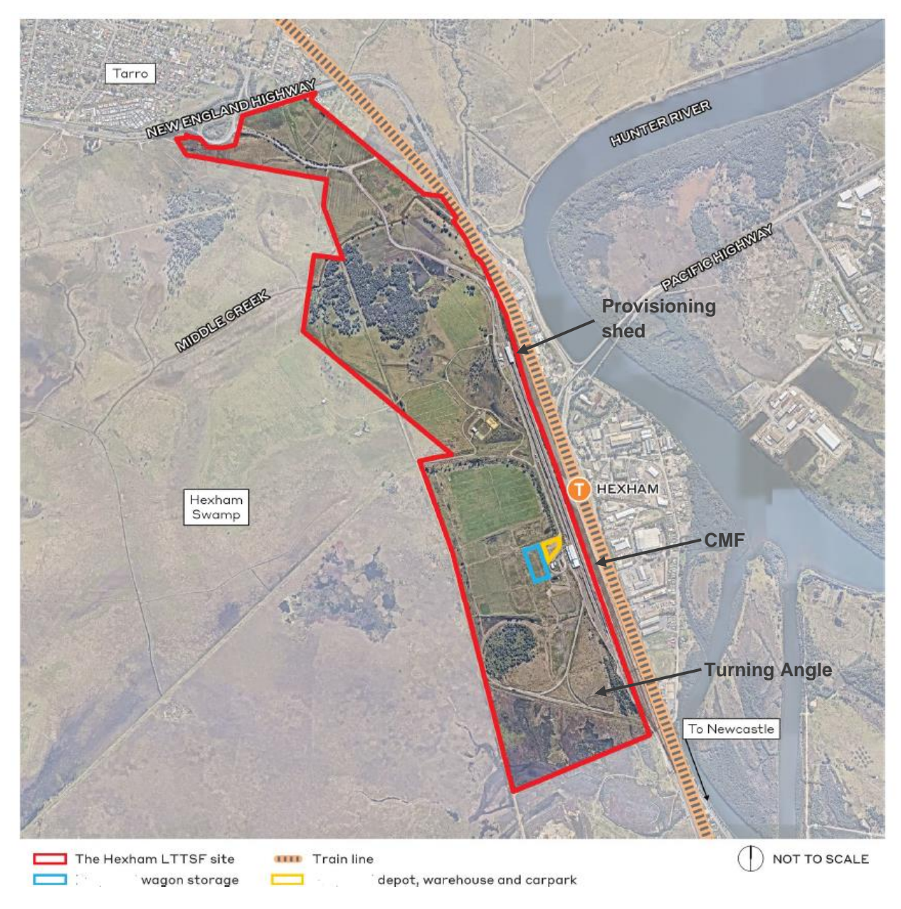
Figure 1 - Project Regional Context