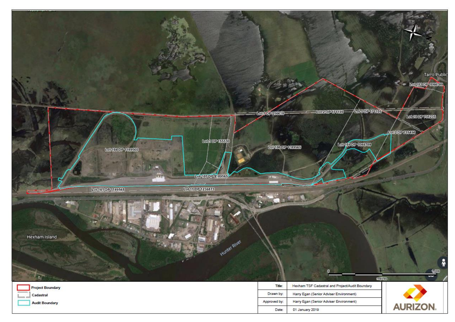
Figure 1 - Hexham TSF Cadastral and Project/Audit Boundary